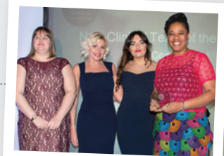
The medical education team

This hardworking team is caring and encouraging to both the service users and to the medical students themselves, who they hope to inspire to specialise in psychiatry. They are dedicated to their role in education and their nomination was supported by a number of service users.