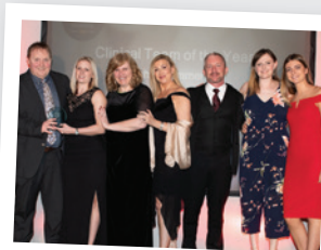
Access to mental wellbeing team

This team has worked hard to help people who have historically fallen between primary and secondary mental health services. The team has made significant improvements. They've introduced new practices and remained flexible to ensure patients are seen more quickly.