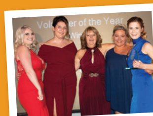
Child and adolescent mental health services participation group

For an individual or team who has shown outstanding commitment and exceptional contribution to the service they support. It is for anyone who volunteers their time and effort to support the Trust.