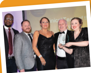
Rapid prison transfer assessment service

For outstanding teamwork in a clinical area, presented to a team that consistently demonstrates a can do approach in implementing change or introducing new services or ways of working.