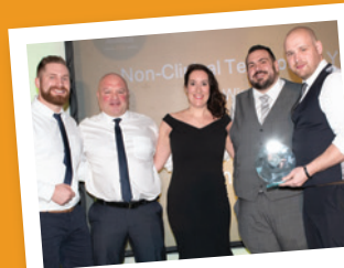
Ridgeway security and training team

Outstanding team work in a non-clinical area, presented to a team that consistently demonstrates a can do approach in implementing change or introducing new services or ways of working.