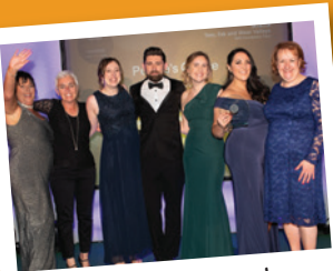
Durham and Darlington liaison and diversion team

This award is chosen by public vote. It celebrates an individual or team who has gone the extra mile to help and support, recognising their care and compassion.